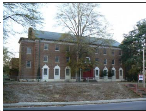
A historic building in the Gillespie-Selden Community in Cordele, GA.

The City of Cordele received a grant from the Historic Preservation Division of the Department of Natural Resources in the amount of $6,000 to complete design guidelines for the Gillespie-Selden Historic District. RVRC staff has assisted the City of Cordele and Gillespie-Selden residents to develop strategies to revitalize the area. In 2010, RVRC staff completed a housing assessment survey for the historic neighborhood as part of an Area Redevelopment Plan. The City of Cordele used information from this plan to apply for and receive USDA funding to perform housing rehabilitation in the Gillespie-Selden neighborhood. The City has also applied for CDBG funding to assist with this process, which is currently under review. The Gillespie-Selden Design Guidelines will analyze housing types and architectural styles found in the neighborhood. The guidelines will also assist city leaders and residents to define architectural features in need of preservation versus those in need of rehabilitation/renovation. Lastly, these guidelines will help community leaders ensure that proposed redevelopment of vacant lots respects the historic character of the Gillespie-Selden area. The development of design guidelines for Gillespie-Selden is an important strategy in the city's overall plan to reinvest in and redevelop this historic neighborhood and recreate a vibrant and healthy Gillespie-Selden.