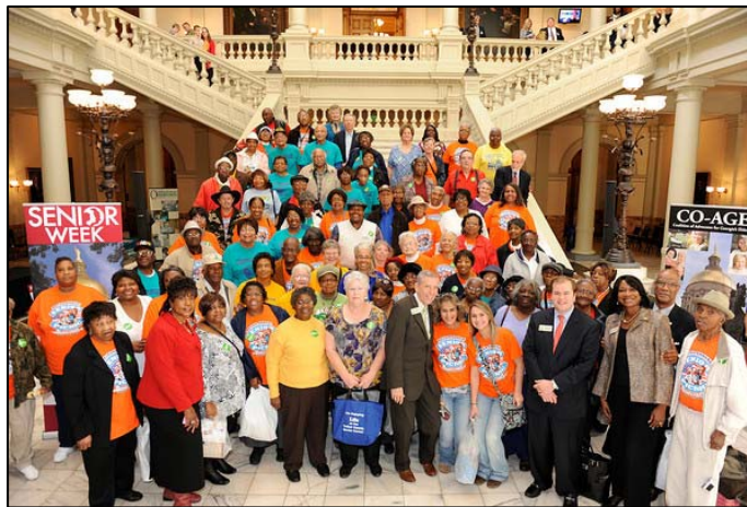
AAA Staff, clients, and other participants at this year's Senior Week at the Capitol.